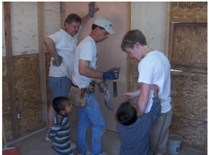
They just want to help us out; packing plywood, cutting 2X4's, or hammering nails, anything to be involved.