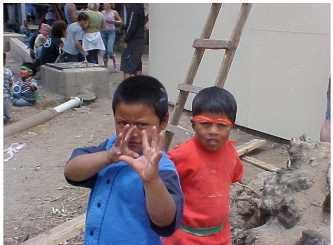
Some young amigos training for the Ninja Turtles. How much fun is THIS!