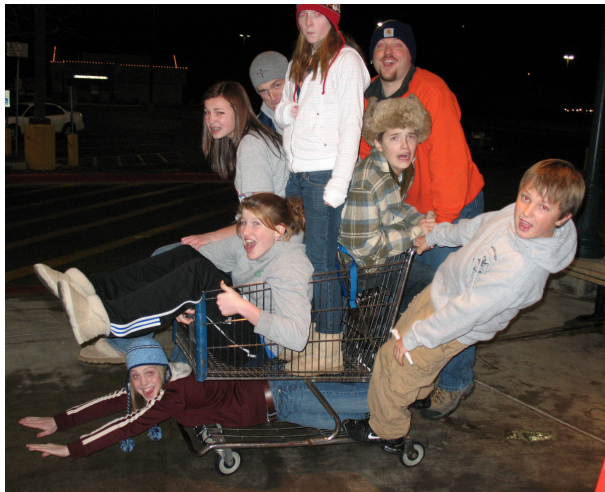
A group of locals at the supermarket.