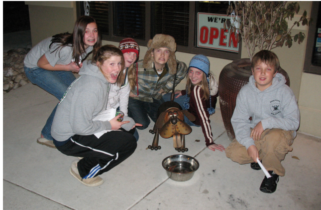
We're not quite sure what they are up to.