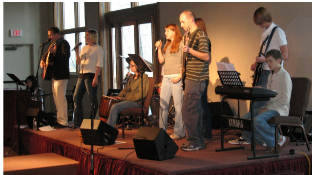
Rockin' out on IAGT Youth Sunday